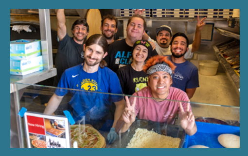
Team of worker-owners at A Slice of New York

• During the COVID-19 pandemic, Yolo Eco-Clean workers had the option not to work if they felt at risk, and they all participated in developing protocols for maintaining the safety of workers and clients. In another example of worker agency, this coop "fired" a client whose guns and drugs made workers uncomfortable in the home.