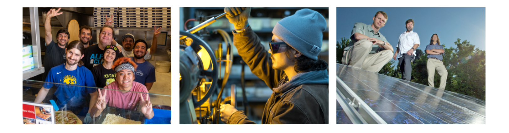
TABLE OF CONTENTS: CALIFORNIA WORKER COOPERATIVES