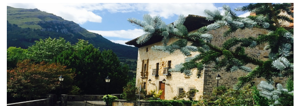
Mondragon training facility